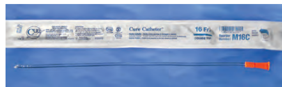
Male, 16", coudé tip catheter with blue control stripe, polished eyelets, and funnel end shown above.