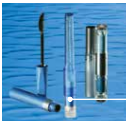
The Cure Twist ® (shown with multiple cosmetic items)

Your healthcare provider has recommended clean self-intermittent catheterization to help empty your bladder and keep your urinary system healthy. The Cure Twist ® catheter may be an ideal option for you if you are a busy woman on the go. Its unique, attractive shape and size are similar to typical cosmetics, making it ideal when discretion and convenience are important considerations.