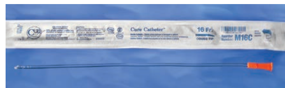
Male, 16", coudé tip catheter with blue control stripe, polished eyelets, and funnel end shown above.