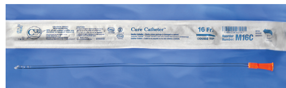
Male, 16", coudé tip catheter with blue control stripe, polished eyelets, and funnel end shown above.